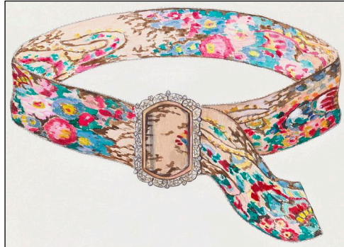
Figure 9