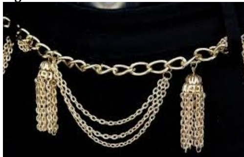
Figure 10