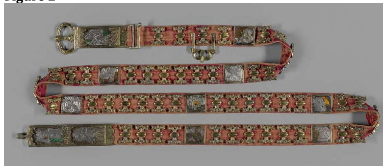
Figure 2 Girdle Belt