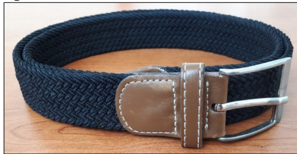
Figure 6