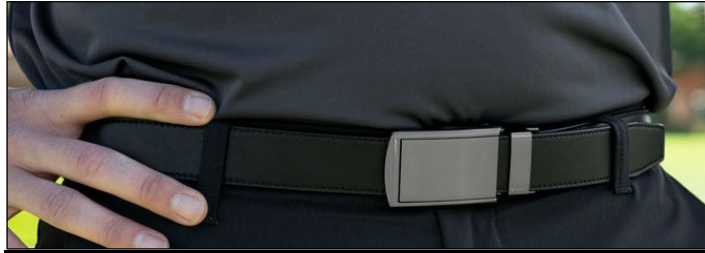
Figure 7

12) Snap Belts: Snap belts provide customization for different ensembles or events with their interchangeable buckles secured by snap fasteners. Constructed from robust materials such as leather, they offer both utility and customization. Ideal for everyday wear, men can switch up the buckles for a different style.